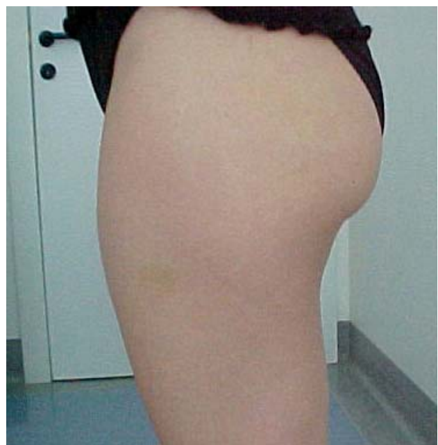
Fig. 2: Clinical situation at the end of the treatment.