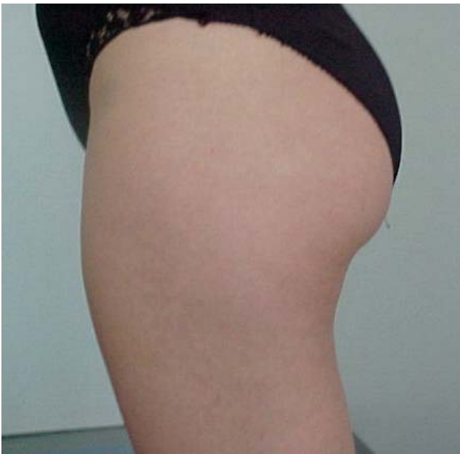
Fig. 1: Clinical situation before the first treatment.